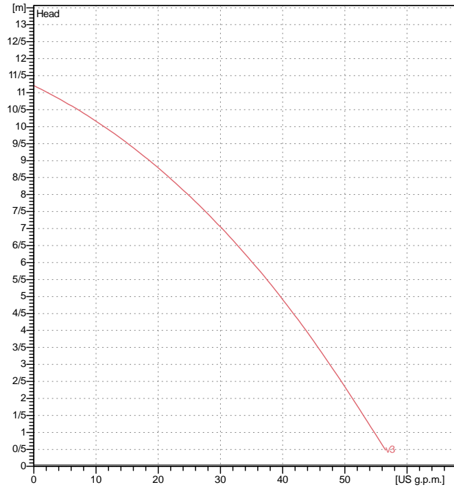
Curve tolerance according to ISO 9906